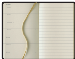
Q61 medium weekly 130 x 210 mm | 160 pages | 15 month diary oct-dec | ribbon marker | FSC® certified