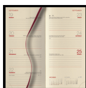
U83 weekly portrait 80 x 170 mm | 144 pages | 13 month diary | ribbon marker* | perforated page corners | FSC® certified *not available in colombia

slimline pocket diary format with monthly calendar grids on cream paper with red & grey print.