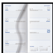
U85 weekly portrait 80 x 170 mm | 144 pages | 13 month diary | ribbon marker* | perforated page corners | FSC® certified *not available in colombia

week to view slimline pocket diary with monthly calendar grids on white paper with blue & grey print.