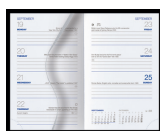
U80 small weekly portrait 75 x 120 mm | 144 pages | 13 month diary | ribbon marker* | perforated page corners | FSC® certified *available in tuscon only

convenient compact week to view diary with monthly calendar grids on white paper with blue & grey print.