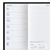
NEW U88 weekly portrait notes 80 x 170 mm | 144 pages | 13 month diary | perforated page corners | FSC® certified

week to view slimline pocket diary with monthly calendar grids and ruled page for notes on white paper with blue & grey print.