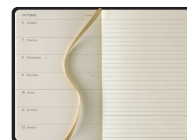
Q51 pocket weekly 90 x 140 mm | 160 pages | 15 month diary oct-dec | ribbon marker | FSC® certified